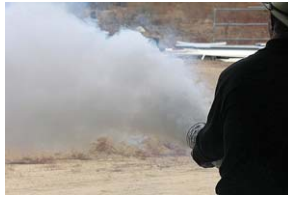
OC smoke testing

The Test Center is located in an isolated area east of San Diego, California, surrounded by the Cleveland National Forest. The secluded location is relatively free of radio signals and other effects that could adversely affect test criteria. Close proximity to the Pacific Ocean, the U.S./Mexico border, and the desert allow easy access for specialty testing.