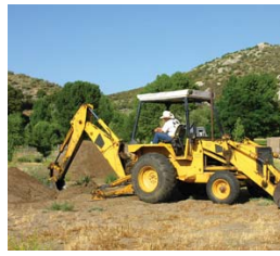
On-site construction equipment

Every effort is made to conduct testing under simulated actual conditions. Each test scenario consists of two parts: