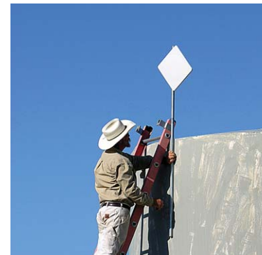
Wireless antenna and camera installation

Operated and managed by Registered Professional Engineers, the Test Center and associates provide professional expertise in: