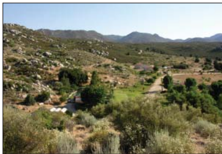
Sandy Creek Ranch

The Test Center is located in an isolated area east of San Diego, California, surrounded by the Cleveland National Forest. The secluded location is relatively free of radio signals and other effects that could adversely affect test criteria. Close proximity to the Pacific Ocean, the U.S./Mexico border, and the desert allow easy access for specialty testing.