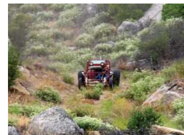
Rugged terrain test