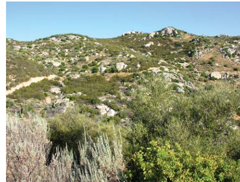
Areas of rugged terrain