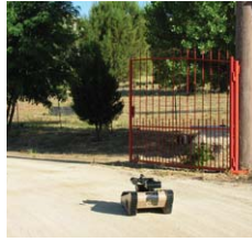
Robot trials at Sandy Creek Test Center

The test site consists of 64-acres including approximately 40 acres of flat test area, 1 1/2 miles of test track with steep slope roadway segments and a year-round creek with ponds for waterside testing. Available on site are a T-1 internet connection, a fiber-optic communications backbone, and a Programmable Logic Control (PLC) command and control system.