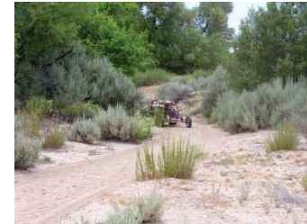
Vehicle test track

Testing under simulated actual conditions