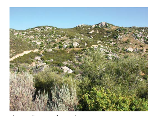
Areas of rugged terrain