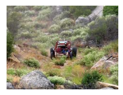
Rugged terrain test