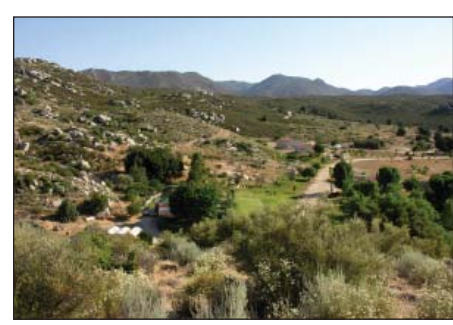
Sandy Creek Ranch

The Test Center is located in an isolated area east of San Diego, California, surrounded by the Cleveland National Forest. The secluded location is relatively free of radio signals and other effects that could adversely affect test criteria. Close proximity to the Pacific Ocean, the U.S./Mexico border, and the desert allow easy access for specialty testing.