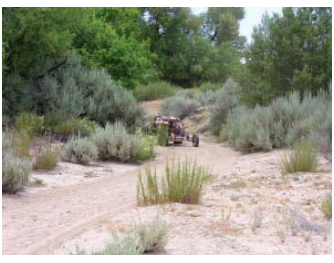
Vehicle test track