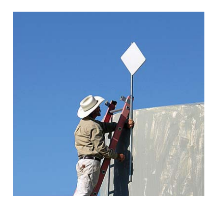
Wireless antenna and camera installation

Operated and managed by Registered Professional Engineers, the Test Center and associates provide professional expertise in: