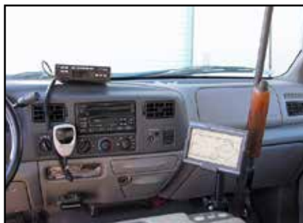
Flat Panel Display

Our compact flat panel solid state displays enable flexible and animated graphic presentations small enough to install in a vehicle and rugged enough to withstand the operating conditions and temperatures. The display is manufactured using a special high intensity flat panel video monitor that is bright enough for daytime viewing and automatically dims for nighttime viewing. The graphic display presentation is custom programmed and held in nonvolatile solid state memory within the display. The display can be almost anything that you desire to display. For example, secure areas can be shown in green; alarm areas in red; and structures, including fences, in other colors. Upon alarm, the alarmed area can flash in any color. Audible signals and voice announcements can accompany alarm signals. When specifying this display system, ask for the MP8500 display system. Contact us or visit our website for detailed information and specifications.