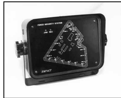
Mobile Map Plus

We began manufacturing rugged vehicle-mounted displays using high intensity solid state lamps in 1991. These displays have proved that they can take the abuse of every day use, enduring the vibration of roving patrol vehicles. Since that time, these displays have also been used in confined spaces, such as gun towers and remote monitoring posts. Each display is housed in a heavy duty drawn aluminum enclosure with military style connectors for wiring connections. The front panel display, typically a graphic representation of the protected area, is manufactured on 3/16" polycarbonate material with the display and working printed on the reverse side for protection. The display panel is specially printed to allow backlighting for nighttime viewing. A non-glare surface is applied to the display panel and an integral enclosure sunshield improves daytime viewing. A rubber gasket seals the display panel to the enclosure. When specifying this display system, ask for the MP2500 display system. Contact us or visit our website for detailed information and specifications.